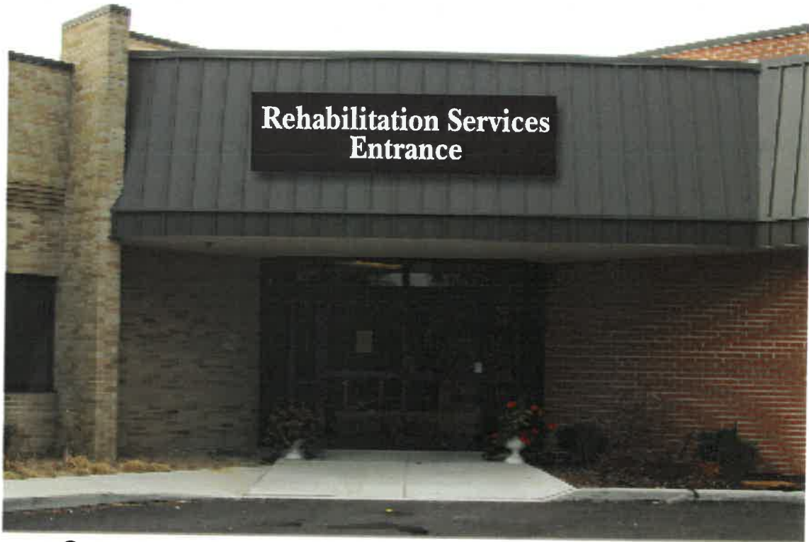
SIGN -© NEW 3' x 12' NON-ILLUMINATED