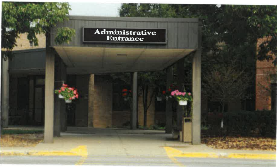
SIGN -E REPLACEMENT FACE (ILLUMINATED) FOR 18" x 8' CABINET