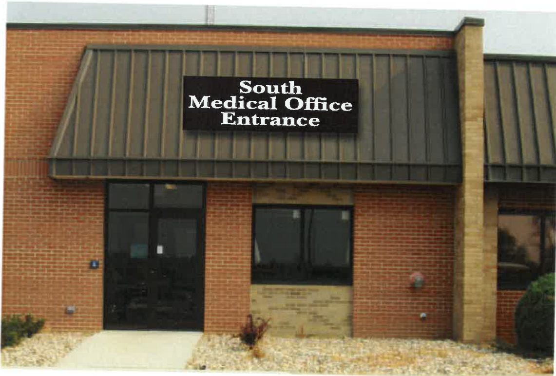
SIGN (B) NEW 3' x 10' NON-ILLUMINATED