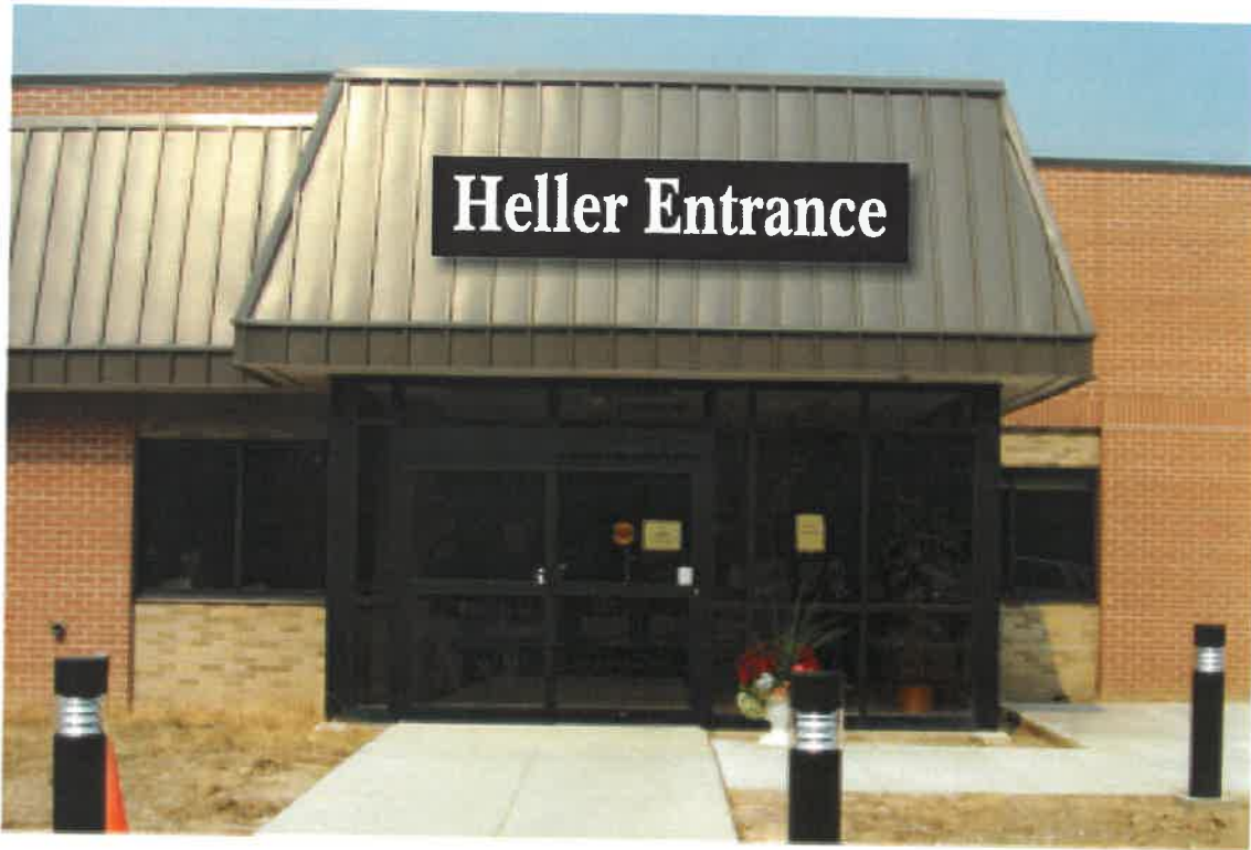
SIGN (H) NEW 30" X 12' ILLUMINATED