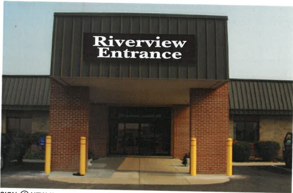
SIGN (A) NEW 3' x 12' ILLUMINATED